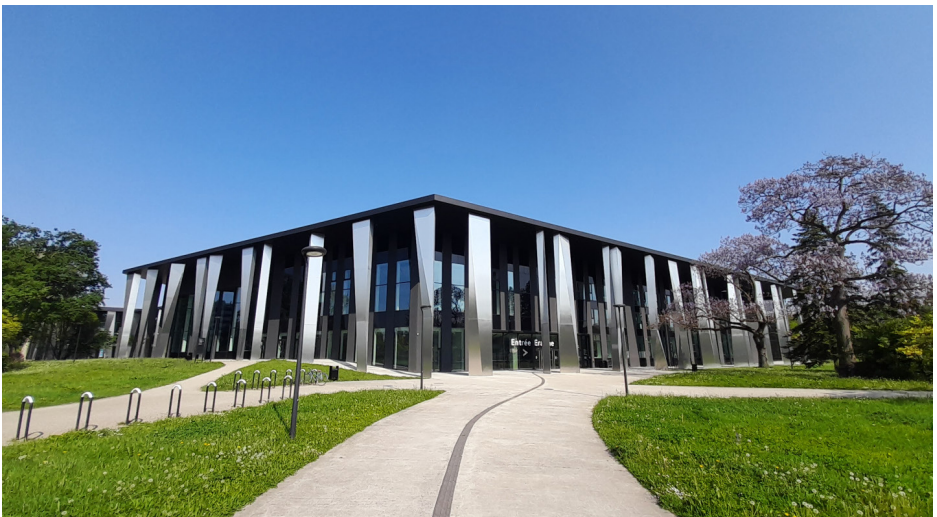
Palais des Congrès et de la Musique, Strasbourg – France

The DSC Organizing Team wishes to all participants and exhibitors a great time at the Driving Simulation Conference Exhibition 2024!